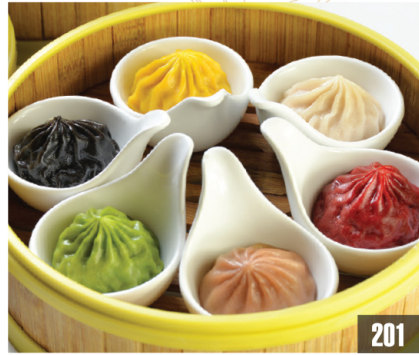
六色小籠包 Rainbow Sampler Shanghai Dumplings D 201