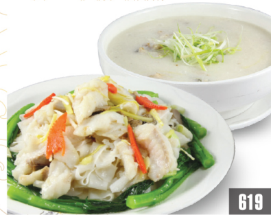
619 大班兩食 Fish & Congee Combo 2-3 $48 4-6 $58 魚片腸粉或炒河 Filet of Fish Rice Roll or Chow Fun 頭腩滾粥 Fish Cheek Congee