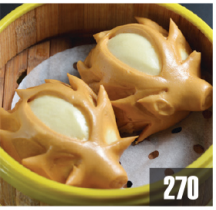
泰式榴蓮包 K 270 Thai Style Durian Buns