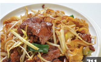
711 乾炒牛河 $22 Stir-Fried Beef Chow Fun