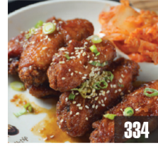
棒棒雞翼 D 334 Honey Glazed Crispy Fried Chicken Wings