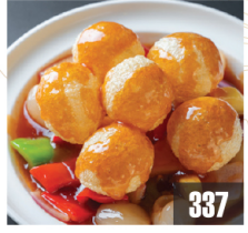
糖醋脆皮球 D 337 Crispy Mini Balls Drizzled w/ Sweet & Sour Glaze