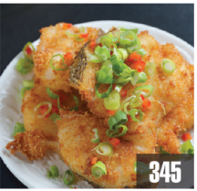
椒鹽鱈魚餃 $13.8 345 Salt & Pepper Sea Bass Kama