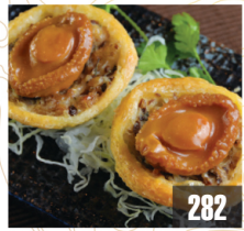
原隻鮑魚酥(2只) B 282 Whole Abalone Minced Chicken Tart