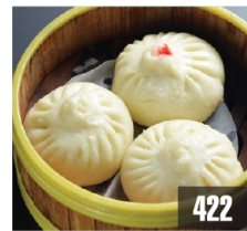
三式素包 L 422 Vegetarian Buns Trio