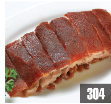
化皮乳豬 $32 304 Hand Roasted Suckling Pig Slice