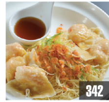
鮑汁雲吞麵$13.8 342 Wonton w/ Noodles in Abalone Broth