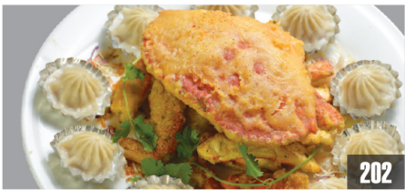
原只加州大蟹小籠包(黑椒味/椒鹽味/薑蔥味)$58 202 Whole Dungeness Crab Steamed Dumplings & Fried Legs