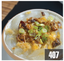
碗仔蘿蔔糕 M 407 Steamed Daikon Cake w/ Dried Shrimp & Preserved Meat