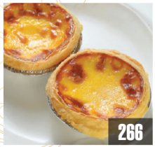
澳門焗葡撻 L 266 Baked Portugese Custard Tart