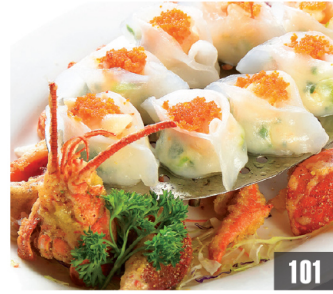
原只龍蝦餃 $65 101 Whole Maine Lobster Steamed Dumplings & Fried Claws