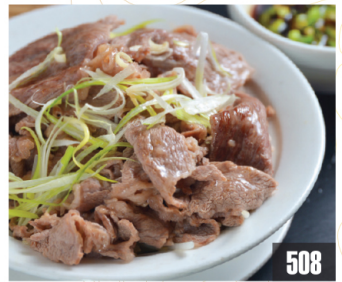
肥牛灼金針菇 $13.8 502 Poached Prime Rib w/ Enoki Mushrooms