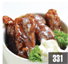
香濃咖啡骨 B 331 Espresso Coffee Ribs