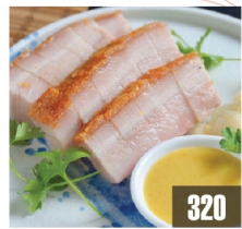
脆皮爆腩仔$20 320 Crispy Hand-Roasted Pork Belly