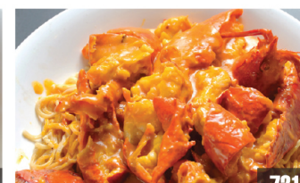
721 金湯龍蝦炆伊麵 $68 Braised E-Fu Noodles w/ Lobster in Pumpkin Soup