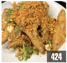
椒鹽多春魚 D 424 Salt & Pepper Smelts