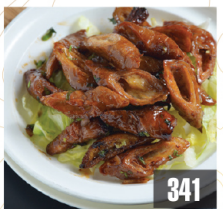
豉油皇豬大腸$18 341 Soy Sauce Grilled Pork Intestines