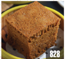
828 黑糖馬拉糕 M Sponge Cake w/ Brown Sugar