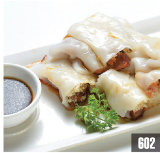
602 叉燒金網腸粉 K BBQ Pork Paste & Rice Crisp Rice Roll