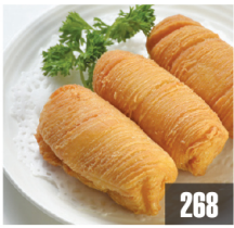
榴蓮酥 D 268 Durian Puffs