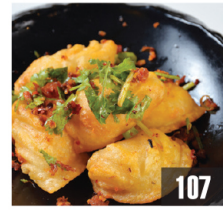
避風塘蝦餃 K 107 Sampan Style Crispy Har Gow