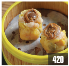
吉品鮑魚燒賣B 420 Steamed Shui Mai w/ Whole Abalone