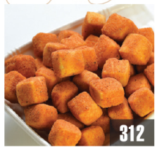
金沙豆腐 L 312 Crispy Tofu w/ Garlic & Herbs