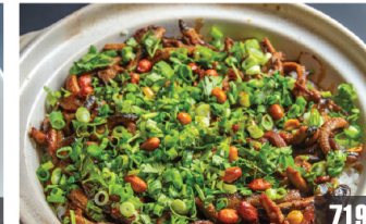
719 台山黃鱔煲仔飯 $58 Rice Clay Pot w/ Eel Toishan Style