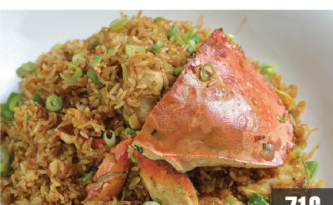
716 大蟹炒糯米飯(半只) $38 Stir-Fried Crab(Half) w/ Sticky Rice