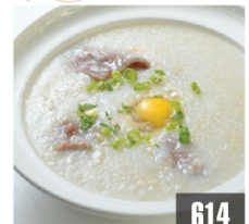
614 窩蛋牛肉粥 $16 Beef & Egg Congee