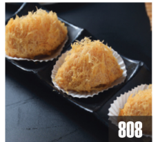
808 蜂巢芋角 L Crispy Fried Taro Puffs w/ Pork