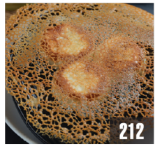
生煎黑椒和牛包 K 212 Pan Fried Black Pepper Beef Buns