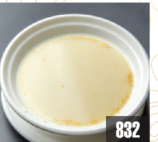
832 寒天雪麥杏仁茶 L Oatmeal Aga Bubbles in Almond Puree