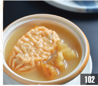
濃湯花膠灌湯餃 B 102 Fish Maw & Seafood Soup Dumpling in Creamy Soup