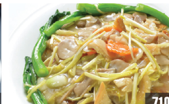
710 貴妃蚌煎米粉 $38 Special Crispy Vermicelli Topped w/ Stir-fry Concubine Clams