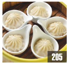
上海小籠包 A 205 Shanghai Dumplings