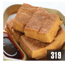
滷水豆腐 L 319 Soy Marinated Tofu Cubes