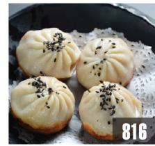
生煎灌湯包 B 816 Pan Seared Juicy Pork Dumplings