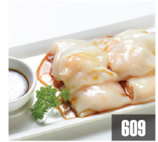
609 鮮蝦腸粉 A Shrimp Rice Roll