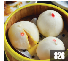
826 奶黃流沙包 M Egg Yolk Lava Buns