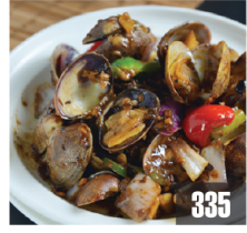
豉椒炒蜆 $13.8 335 Stir-Fried Clams in Black Bean Sauce