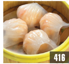
筍尖蝦餃王 K 416 Shrimp Dumplings (Har Gow)