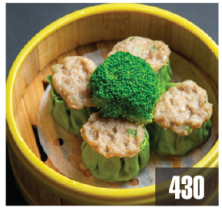
桂花牛肉燒賣 M 430 Osmanthus Beef Shui Mai