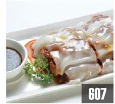
607 叉燒腸粉 L BBQ Pork Rice Roll