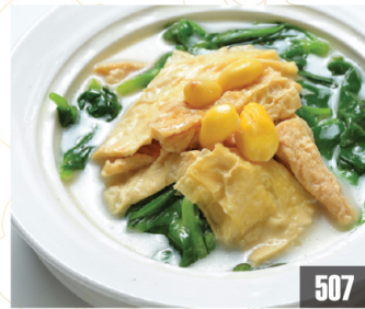
銀杏腐竹浸大豆苗 $13.8 505 Ginkgo Nuts & Pea Vines w/ Tofu Skin in Premium Broth