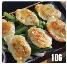
和汁鐵板餃子A 106 Sizzling Fried Pork Dumplings