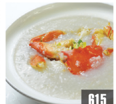
615 蟹粥 $32 Crab Congee