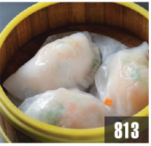
鳳城鮮蝦粉果 K 813 Country Style Shrimp Dumplings