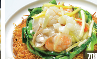
708 海鮮煎兩面黃 $26 Pan Seared Crispy Noodle w/ Mixed Seafood