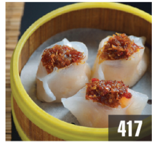
XO 餃 K 417 Steamed Shrimp Dumplings Topped w/ XO Sauce