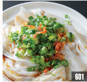
601 鴛鴦蝦乾蒸陳村粉 D Steam Chan Cun Noodles w/ Dual Dried Shrimps