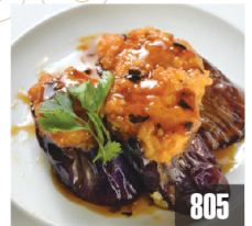
805 百花釀茄子 L Eggplant Stuffed w/ Shrimp Paste