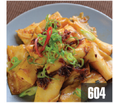
604 XO醬煎腸粉 K Stir-fried Rice Roll w/ XO Sauce