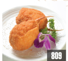
809 炸蟹鉗 K Deep Fried Crab Claws w/ Shrimp Paste