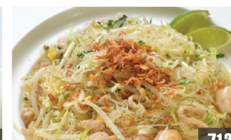
712 泰式炒米線 $22 Thai Style Stir-Fried Vermicelli w/ Shrimp