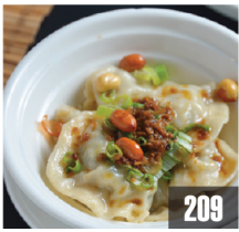
紅油抄手 K 209 Pork Dumplings in Chili Sauce