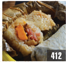
粒粒瑤柱糯米雞B 412 Delux Chicken w/ Sticky Rice Stuffed in Lotus Leaf Wraps