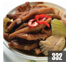
胡椒酸菜鴨掌 B 332 White Pepper, Pickled Veggie, Duck Webs