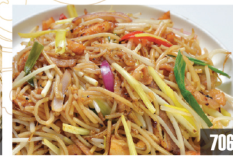
706 順德家鄉炒米線 $22 Stir Fried Hometown Thin Vermicelli w/ Pork, Shrimp, Fish Cake & Jellyfish