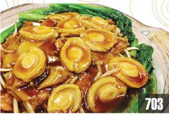
703 鮑汁金網鮑魚(8只)撈河粉 $38 Deluxe Abalone(8) over Chow Fun