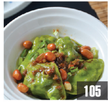
麻辣菠菜海鮮餃K 105 Sichuan Spicy Seafood Dumplings