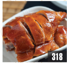
深井燒鴨 B 318 Oven Roasted Duck