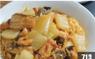
713 蘿蔔鱈魚撈粗生麵 $32 Thick Noodles Stir Fried w/ Braised Seabass & Daikon