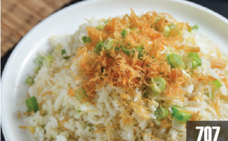
707 瑤柱蛋白炒飯 $24 Dried Scallop & Egg White Fried Rice