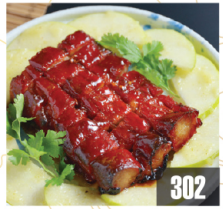
叉燒王 $22 302 Freshly Roasted BBQ Pork Royale