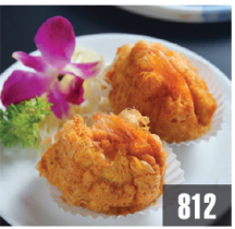
香芋鳳尾蝦 K 812 Fantail Shrimp in Taro Puff