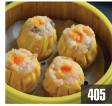
北菇燒賣 M 401 Shrimp, Pork & Mushroom Dumplings (Shui Mai)