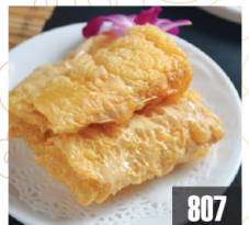
807 鮮蝦腐皮卷 L Crispy Fried Tofu Skin Wraps w/ Shrimp