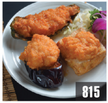
煎釀三寶 L 815 Pan Seared Stuffed Triple Treasure