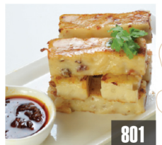
801 XO醬煎蘿蔔糕 L Pan Fried Daikon Cake w/ XO Sauce