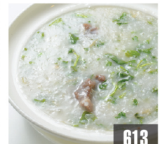
613 西洋菜鹹豬骨粥 $16 Watercress & Salted Pork Bone Congee