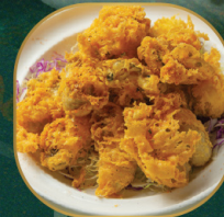
酥炸日本生蠔 Crispy Fried Japanese Oyster