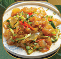
蒜泥岡山海哲頭 Marinated Jelly Fish with Mashed garlic