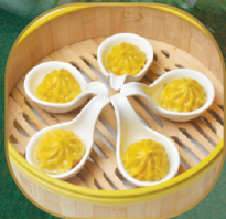
蟹粉小籠包 Shanghai Crab Roe Dumplings (10)