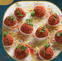
脆珍珠陳皮魚球 Deep-Fried Crispy Fish Ball with Mandrain Peel