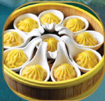
蟹粉小籠包 Shanghai Crab Roe Dumplings (10)