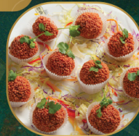
脆珍珠陳皮魚球 Deep-Fried Crispy Fish Ball with Mandrain Peel